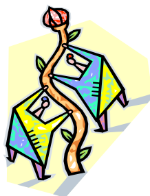
Support our work

To help us achieve these aims our publicity team: